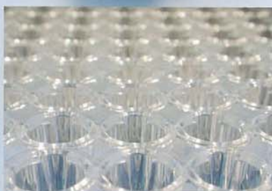
Reads 12 to 384 well plates